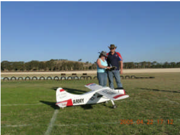
Who said these pilots don't need an assistant!