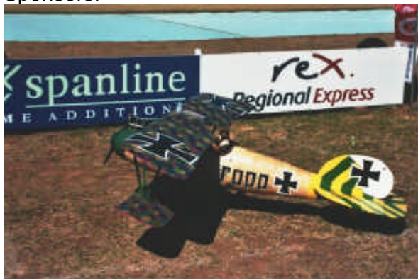
Crazy Jim's Mitre 10 Fishing World REX Regional Express Spanline