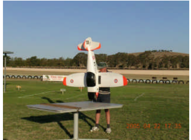
Bill Lampe with Cap - 10B – great flying round 1 but it never got to land and then no more – just about rebuilt look out 2006!